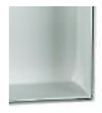
Recessed Door Accepts 1/2" Insert